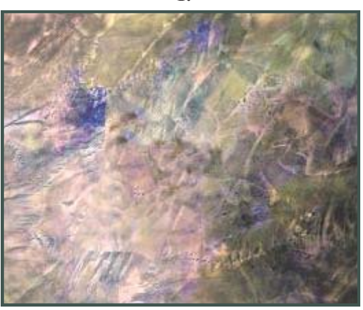
2. Venetian plaster effect; Apply a full coat of colour smooth as possible, after it dries 1½ coats cross hatched colour of your choice, burnish when firm but not fully dry. Coat with flat wax and burnish (polish) to finish. See below: